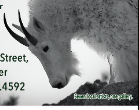
Seven local artists, one gallery.

A GALLERY OF GIFTS AWAITS! Open All Year!