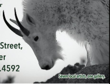
Seven local artists, one gallery.

A GALLERY OF GIFTS AWAITS! Open All Year!